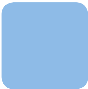
Pantone 2915 CMYK: 61-C, 7-M, 0-Y, 0-K RGB: 94-R, 182-G, 228-B