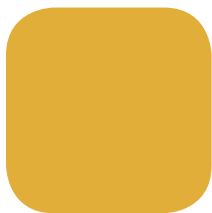
Pantone 1375 CMYK: 0-C, 56-M, 100-Y, 7-K RGB: 255-R, 160-G, 47-B