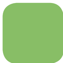
Pantone 360 CMYK: 62-C, 0-M, 78-Y, 0-K RGB: 97-R, 194-G, 80-B